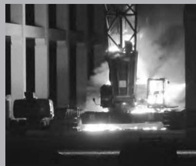
Incendiary sabotage of a crane on the building site of an Amazon logistics center, Achim, Germany, July 2020.

We include this text even though it is referring to Ring in a French context it is important for a UK context because of the increased use of the door cameras which are not subject to EU law anymore and could or are already being used in the same way as in the US.