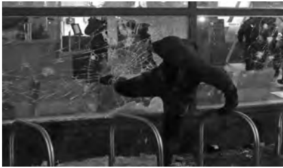
Burn Baby Burn! Continued...

to burn last night. No one is allowed to live freely in this new fascist dystopia of Priti Patel (wannabe Thatcher!) and Boris Johnson (who plays the clown but is as right wing as they come!), not only does the bill give the power to 'disturbed citizens' and the cops to literally move on travelers even of one vehicle at the slightest complaint from the obedient public, but also gives them the ability to take peoples vehicles and possessions. Apart from an attack on van and caravan dwellers this is the racist attack from the Tory government on Roma, Gypsy and Irish Travelers, a group who have always been attacked in the 'country of apparent toleration'.